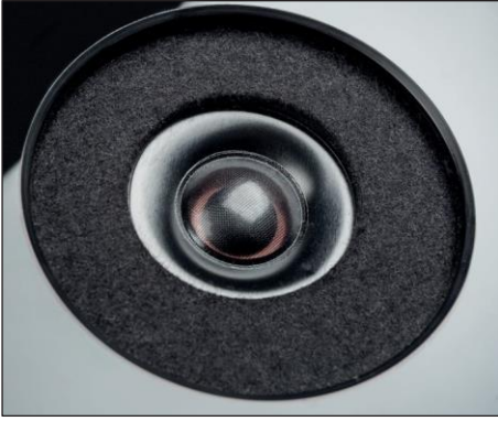
At first glance, it looks like a dome, but it is in fact a cone tweeter