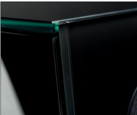
The glass walls lend the Avanti a unique appearance