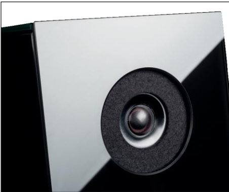
The dampening all around the cone is an essential element of the tweeter