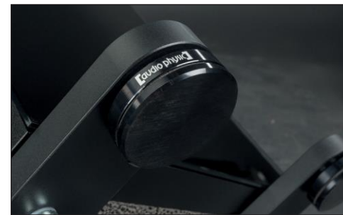
Floating on air: the new magnetic feet for uncoupled set-up