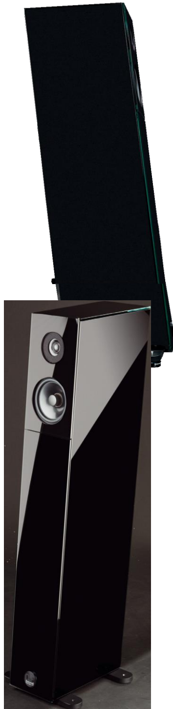
It has a more chiselled appearance since the last iteration, but no less elegant: the Audio Physic Avanti