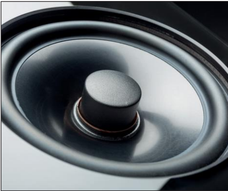
The conspicuous phase plug is but one of the special features of the midrange driver – the uncoupled basket design is spectacular